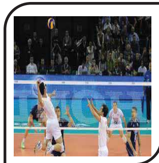
b.vol – – yball