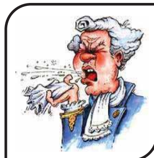
c. sn – – ze