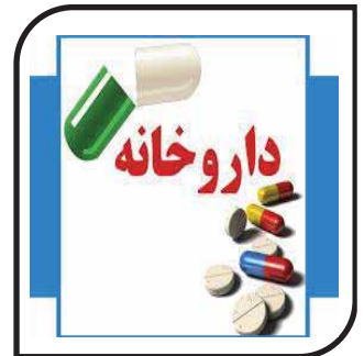
d. dr – gstor