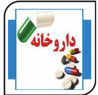
d. dr – gstor